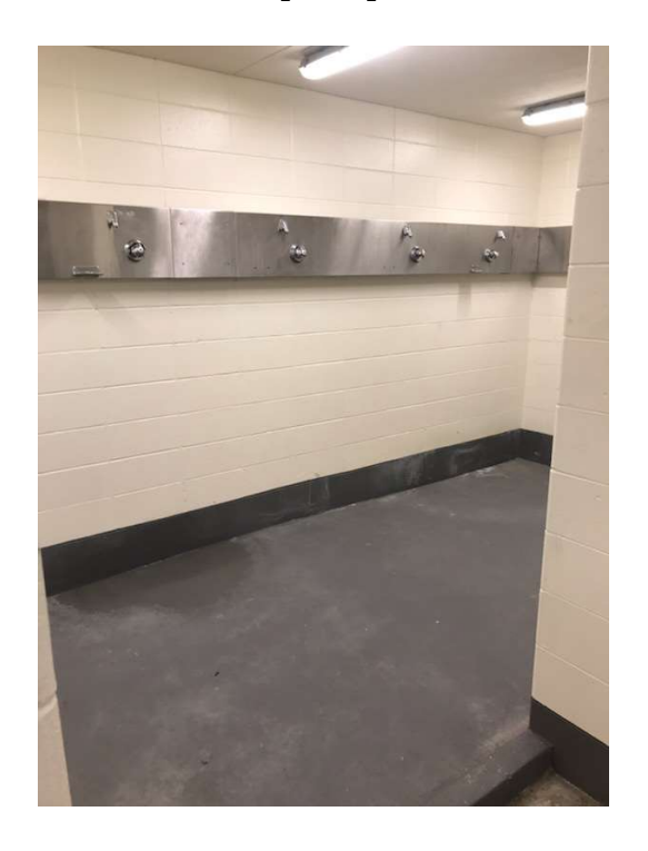
(See B.E. Dkt. 29-6 at 1, 3-12 (Cox Decl. at \P\P 5-6 and accompanying photos); B.E. Dkt. 29-4 at 4 (VCSC Dep. at 43:19-21).)

The locker room showers are an open space and do not have private stalls: