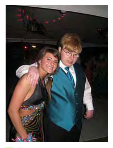
Uploaded on Apr 5, 20102 comments