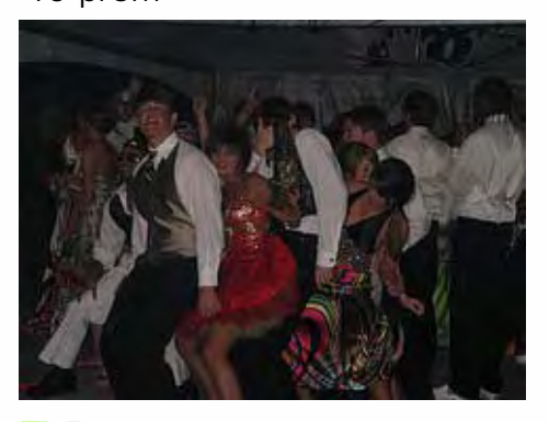
C All rights reservedUploaded on Apr 5, 20105 comments