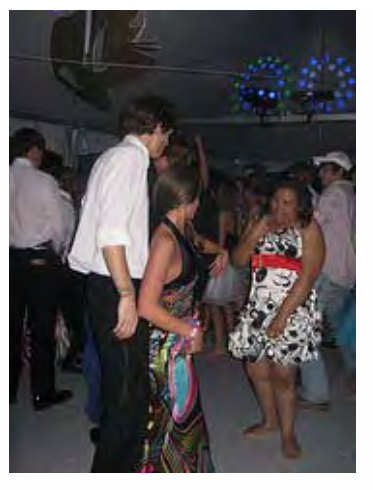
Uploaded on Apr 5, 2010 4 comments