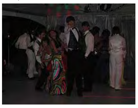
Uploaded on Apr 5, 2010 2 comments