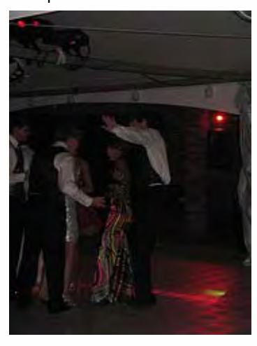
Uploaded on Apr 5, 2010 1 comment