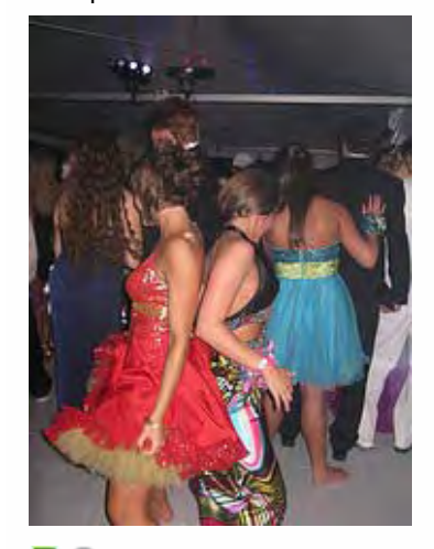
C All rights reservedUploaded on Apr 5, 20106 comments