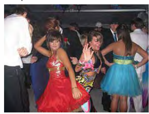
C All rights reservedUploaded on Apr 5, 201019 comments