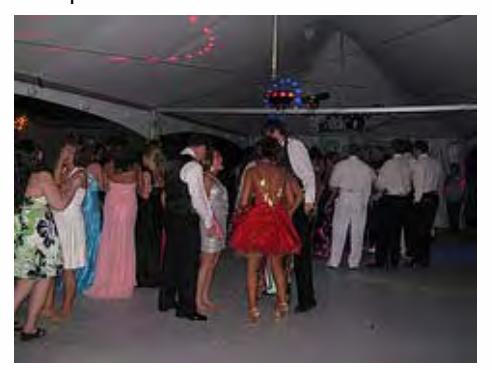
Uploaded on Apr 5, 20102 comments