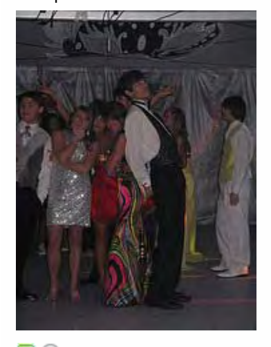
© All rights reserved Uploaded on Apr 5, 2010 1 comment