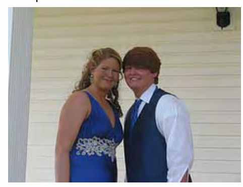
All rights reservedUploaded on Apr 5, 2010