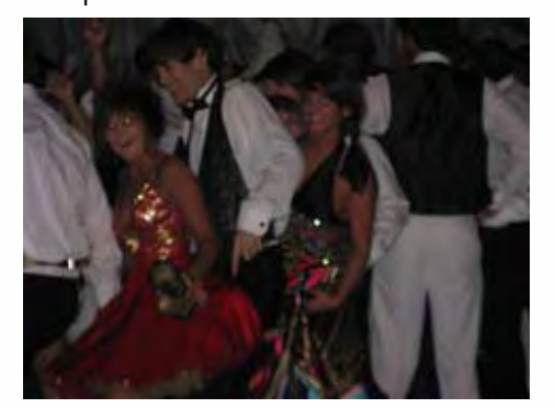
Uploaded on Apr 5, 2010 1 comment